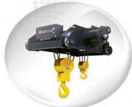
Main & Aux. Type