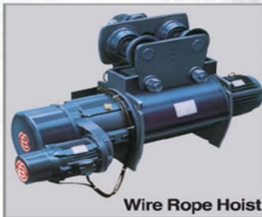
Wire Rope Hoist